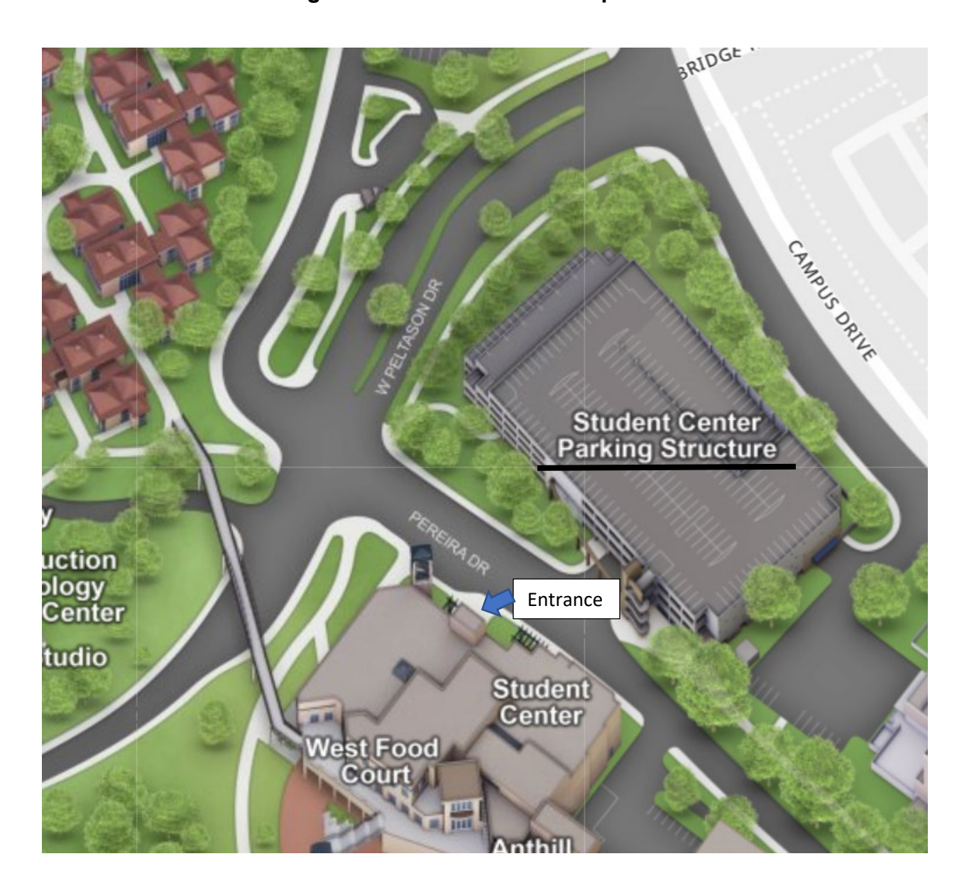
Figure 1 – Student Center Map